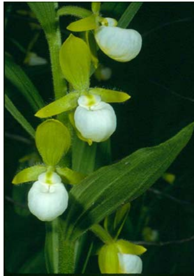
California lady's-slipper Cypripedium californicum

Species not illustrated that will be blooming in June include Calypso bulbosa , Plantanthera hyperborean , Piperia elegans , P. unalascensis , Coralorhiza maculata , C. mertensiana , C. striata , Listera caurina , L. convalarioides , and Cypripedium fasciculatum .