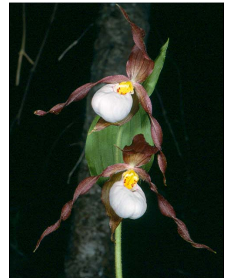
Mountain lady's-slipper Cypripedium montanum