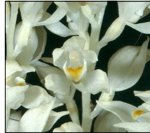
Phantom orchid Cephalanthera austinaiae