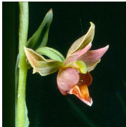
Stream orchid Epipactis gigantea