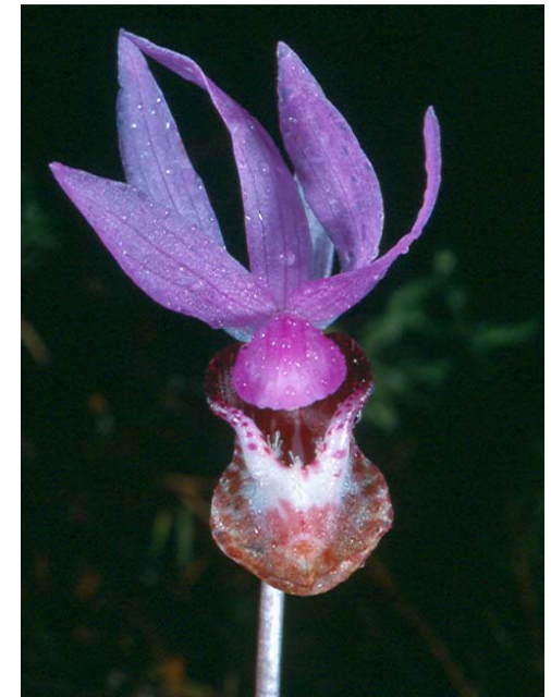
Calypso Orchid, Calypso bulbosa

5th Annual Native Orchid Conference June 9 - 12, 2006